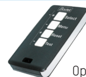
Option: wireless remote control